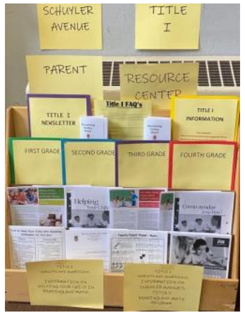
Schuyler Ave. Elementary

Don't forget to visit the Title | Parent Resource Center at your child's elementary school. Educational resources such as brochures, reading & math strategies, books, and more are available for you to take home (resources may vary between schools.) All resources are FRFF!