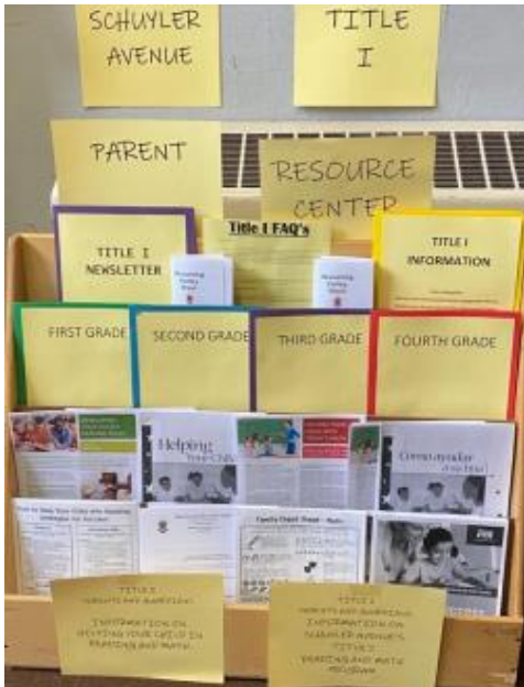
Schuyler Ave. Elementary

Don't forget to visit the Title I Parent Resource Center at your child's elementary school. Educational resources such as brochures, reading & math strategies, books, and more are available for you to take home (resources may vary between schools.) All resources are FREE! 😊